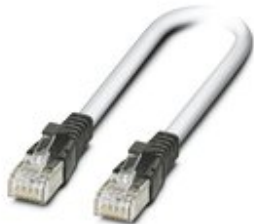
Patch cable, CAT5, assembled, 0.3 m

Please be informed that the data shown in this PDF Document is generated from our Online Catalog. Please find the complete data in the user's documentation. Our General Terms of Use for Downloads are valid ( http://phoenixcontact.com/download )