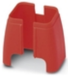
Security element for FL patch cable

Port Guard Security Element - FL PATCH SAFE CLIP - 2891246