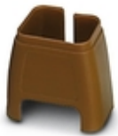
Color marking for patch cable, brown