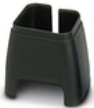
Color marking for patch cable, black