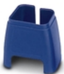
Color marking for patch cable, blue